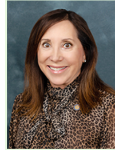
Sen. Lori Berman District 26