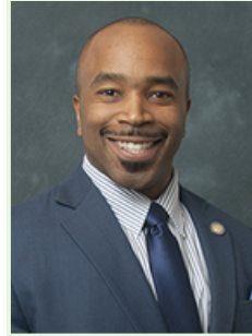
Sen. Bobby Powell, Jr. District 24