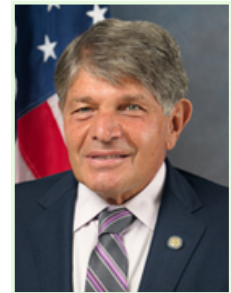
Rep. Joe Casello District 90