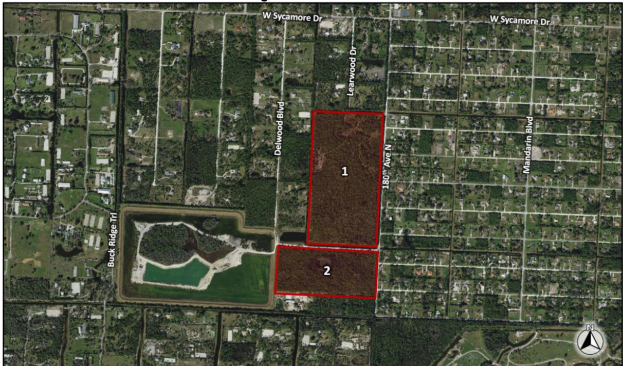
Figure 1- Site Aerial