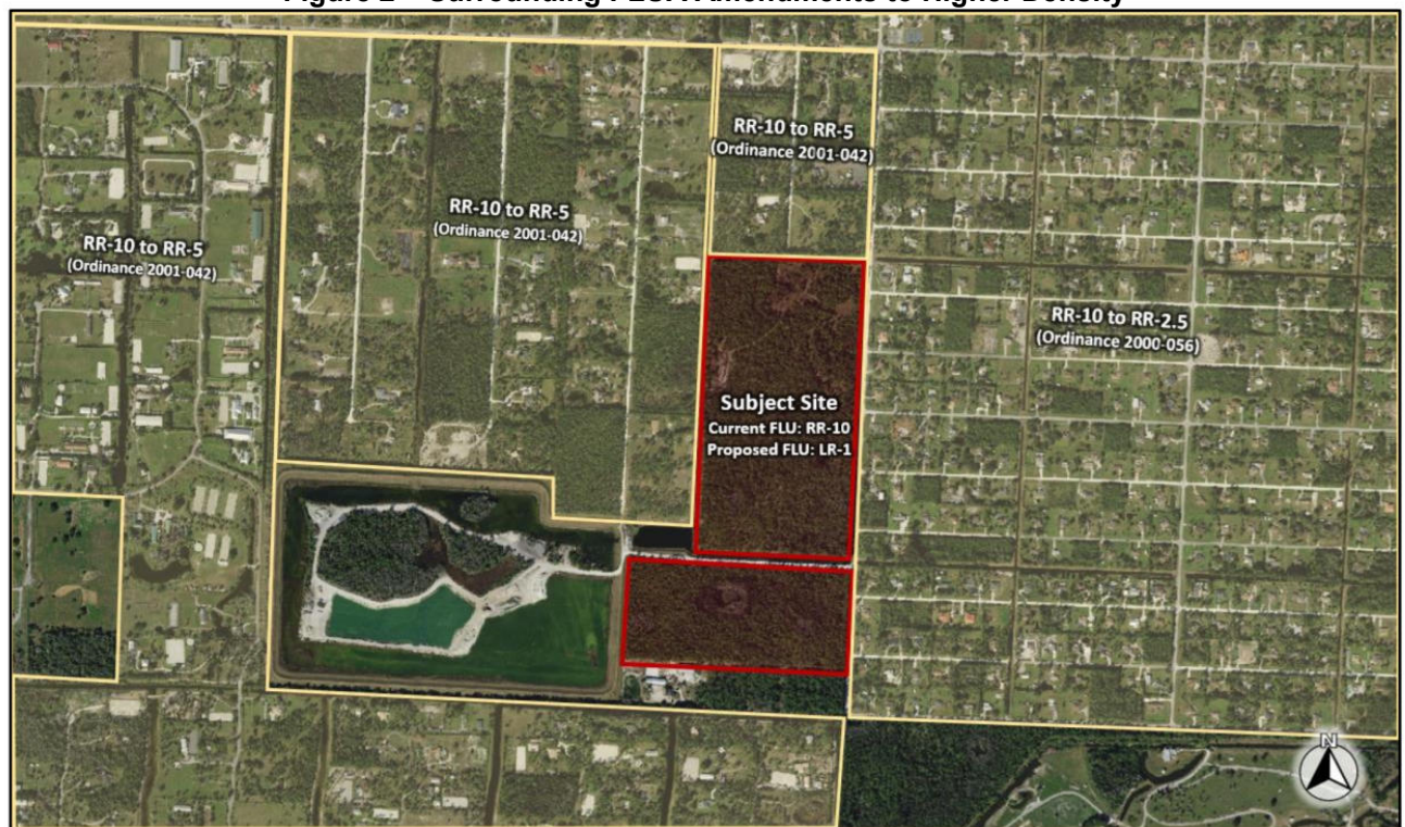
Figure 2 – Surrounding FLUA Amendments to Higher Density

Amending the Comprehensive Plan language to create the Overlay and permit the LR-1 FLUA designation in the Rural tier will allow the currently underutilized site to be a new source of much-needed housing to support a growing population and address the impacts of the housing crisis. The proposed Overlay, FLUA Amendment from RR-10, Rezoning from AR to RT and Class A Conditional Use is consistent with the development pattern in the area. The surrounding residential areas have undergone FLUA Amendments to higher density, from RR-10 to RR-5 and RR-2.5, with the properties designated RR-2.5 actually being between 1.1 and 1.5 acres inclusive of the adjacent roadways and drainage canals. Figure 2 below shows the surrounding areas and their approved amendment to higher density. The subject site is one of the only properties that is still designated as RR-10, with the only exceptions being the Indian Trails Improvement District Facility to the southwest and the private residential lot directly to the south.